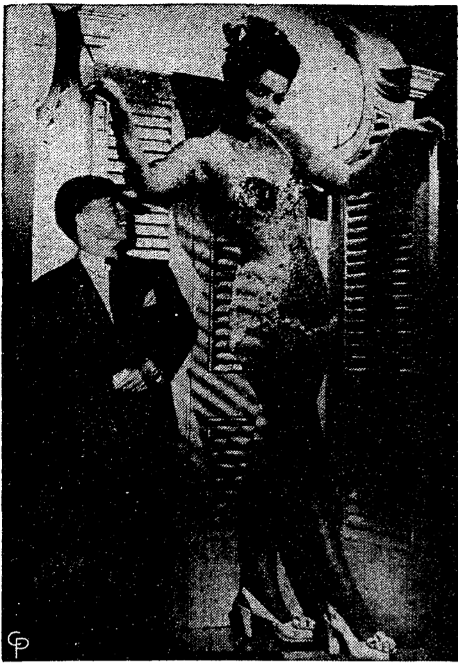
This superimposed picture gives you a rough idea of what the stature story is with Mickey Rooney and actress Martha Vickers, to whom he announced he is engaged. She is 6 inches taller, but would be shortest of his three wives.