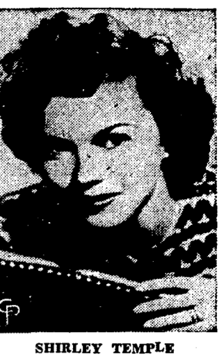
SHIRLEY TEMPLE WIBA at 8