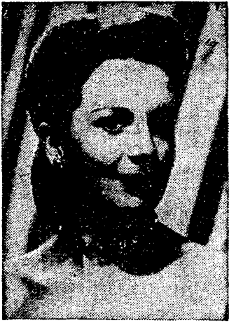
DEBORAH KERR WIBA at 9