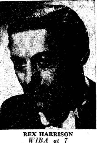
REX HARRISON WIBA at 7