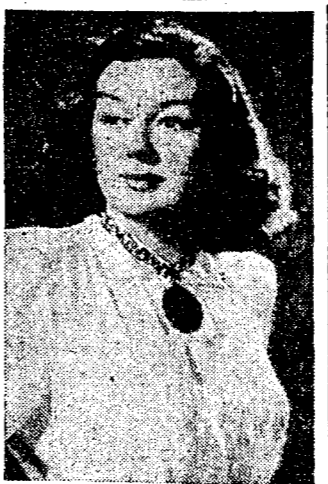
ROSALIND RUSSELL WBBM at 8