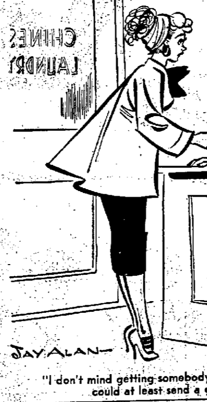
"I don't mind getting somebody else's laundry, but you could at least send a girl's laundry!"