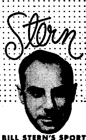
BILL STERN'S SPORTS NEWSREEL OF THE AIR