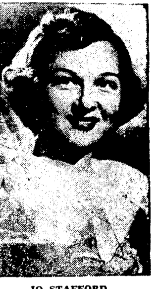
JO STAFFORD It took some persuading by her friends, but titan-haired Jo Stafford, Tuesday night singing star of NBC's "Supper Club," has changed to the "new look" hair-cut.