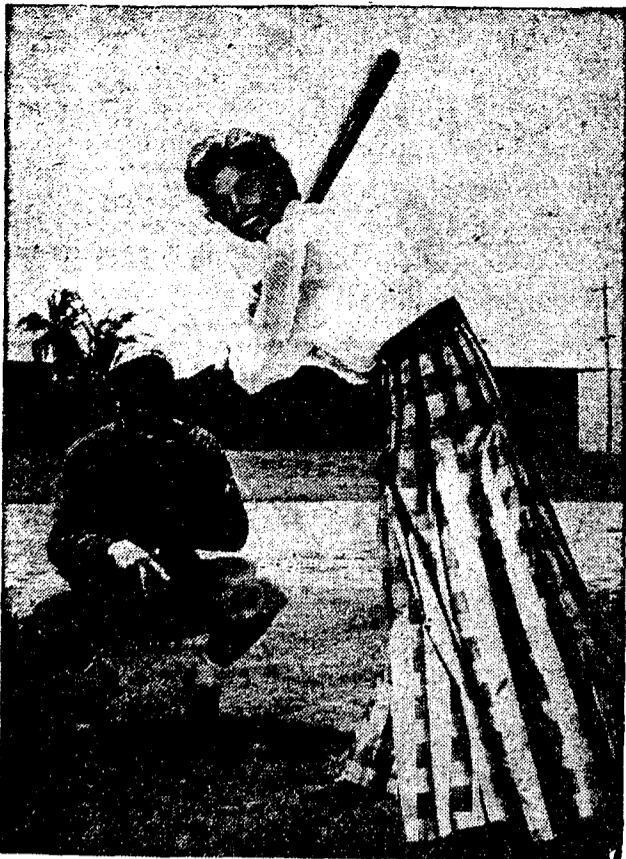
That's Esther Williams at bat, with Gene Kelly playing catcher. They were having fun between scenes on the set of "Take Me Out to the Ball Game," in which Kelly portrays a ball player and Miss Williams appears as owner of the team.