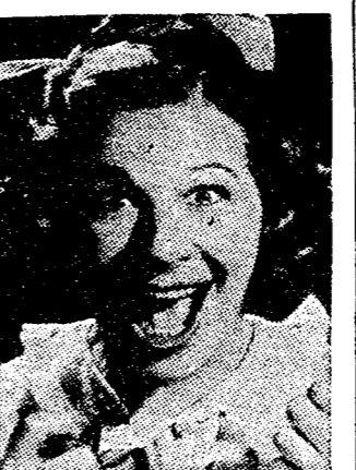
FANNIE BRICE WIBA at 9 p. m.