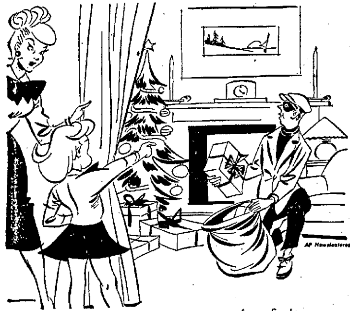
"Hurry, Mom, if you want to see a funny Santa, he's taking things instead of leaving them!"