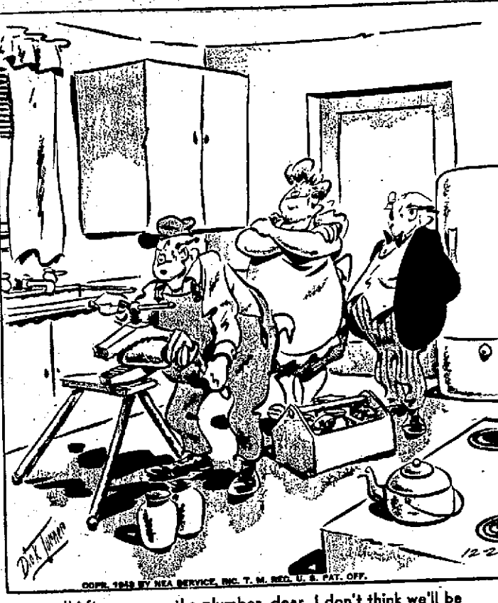
"After we pay the plumber, dear, I don't think we'll be much ahead on our home canning!"