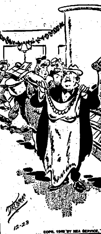
"Why look any farther, Joe? After all, in a gift the main thing is the sentimental and exchange value!"