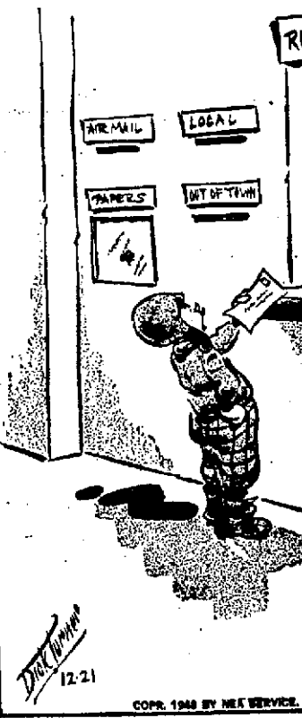
"That's what I said—to Santa Claus; North Pole, registered mail, return receipt requested!"