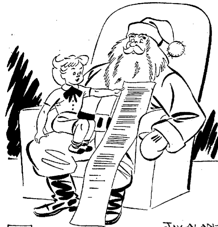
"Here are a few little things that I forgot to put in my letter."