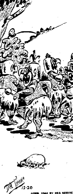
"According to my interpretation of the dance, Professor, they're seeking a loan from the United States!"