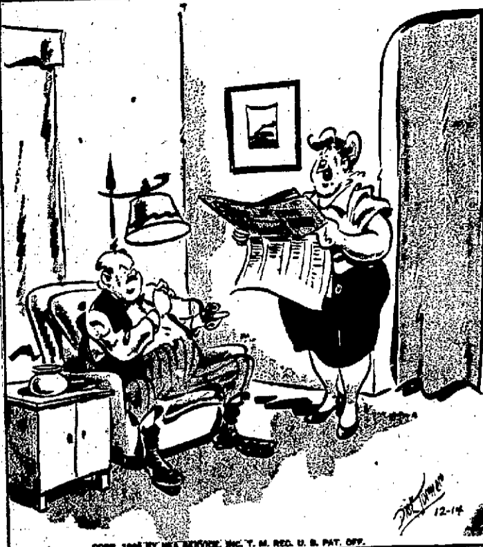
"Just listen to this, Waldo—the new supermarket is offering $15 worth of groceries on opening day for only $15!"