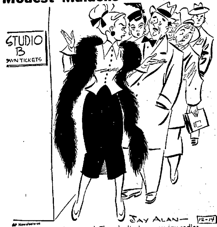
"This program's no good. They don't give away any radios, deep freeze units or necklaces, just money!"