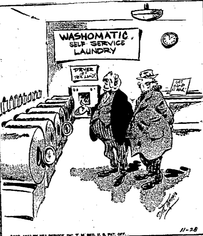
"It all grew out of my wife winning washing machines on radio quiz programs!"