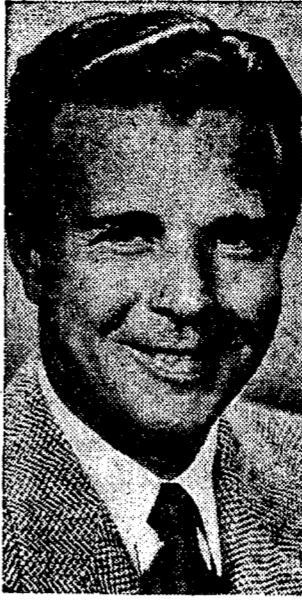
DICK POWELL WIBA at 8