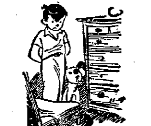
Mom saves everything. If she buys anything new, she keeps the old one for emergency and it's another piece of junk to clutter up my room.