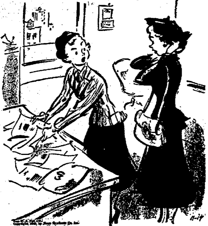
"I always mess up my desk before I go to lunch so the boss will think I've been working."