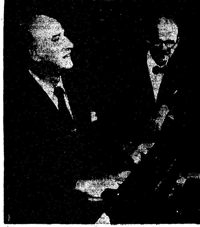
WBBM at 2