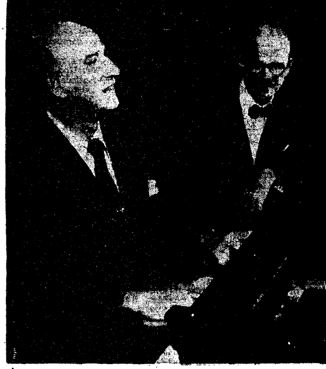
DIMITRI MITROPOULOS and DEEMS TAYLOR