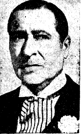
ARTHUR TREACHER WIBA at 7:30