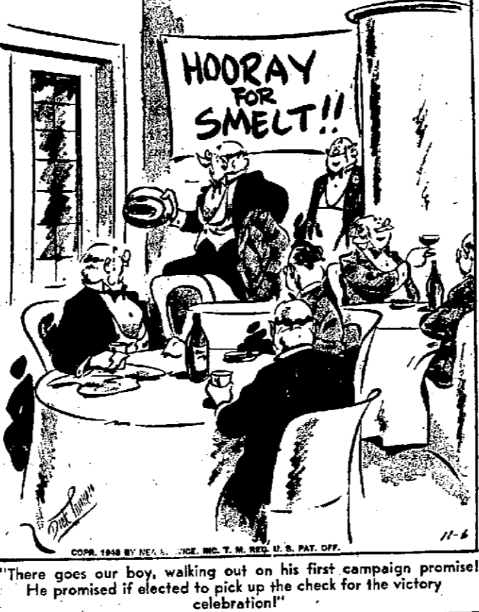
"There goes our boy, walking out on his first campaign promise! He promised if elected to pick up the check for the victory celebration!"