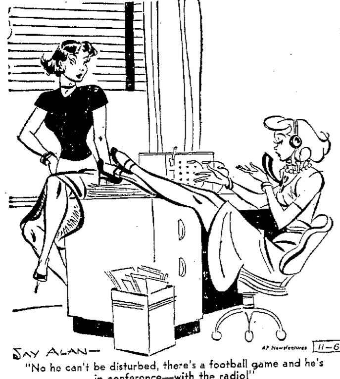
"No ha can't be disturbed, there's a football game and he's in conference with the radio!"