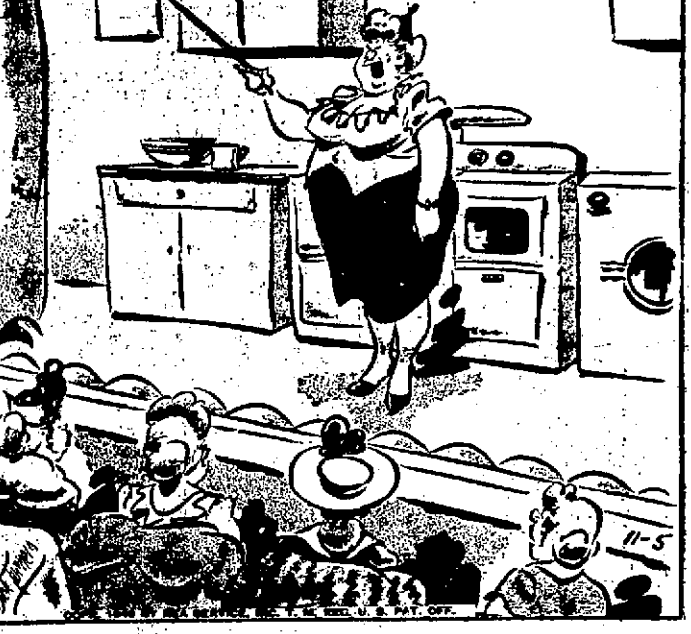
"And now to start with a basic point in the modern kitchen—the fuse-box!"