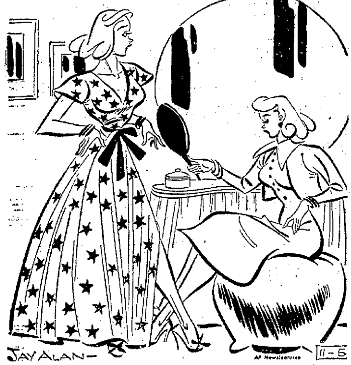
"Do you think I look cute enough now to talk to Bill on the telephone?"