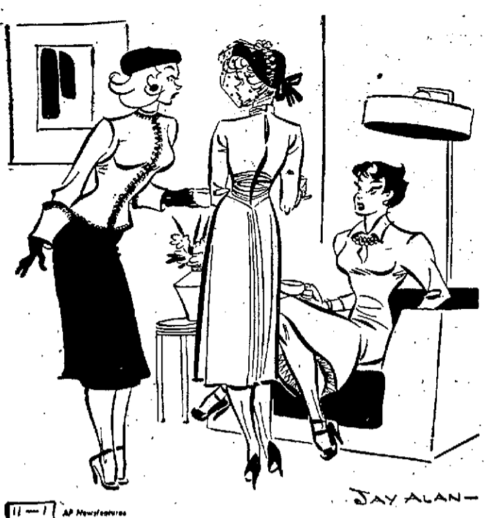
"She just hates him, but she'll never leave him because she loves him so!"