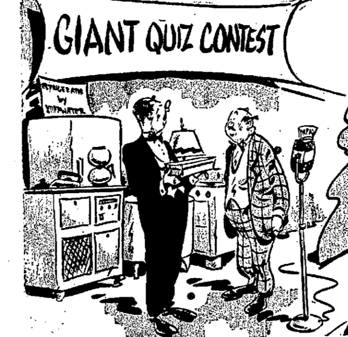
"Oh, I'm sorry, sir, but as consolation for missing our jackpot question, may we present you with this 10 years' supply of headache tablets?"