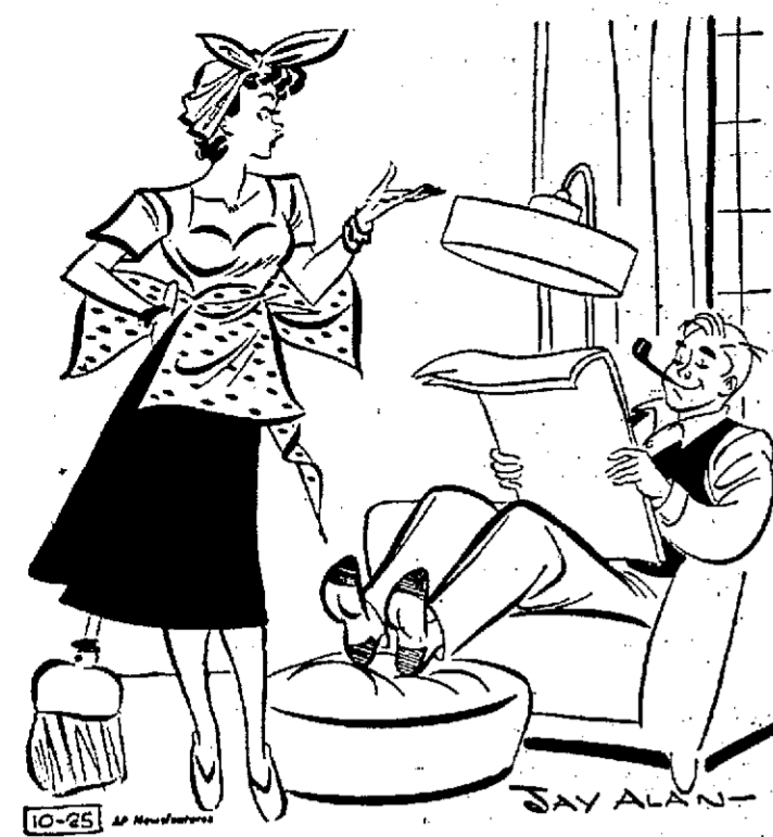
"If you're going to treat me like a servant, you might at least pay me like one!"