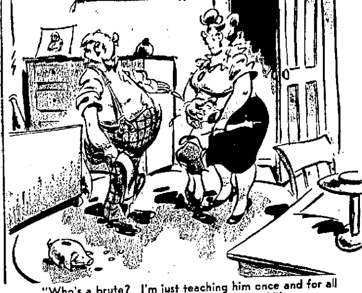
"Who's a brute? I'm just teaching him once and for all not to put slugs in his piggy bank!"