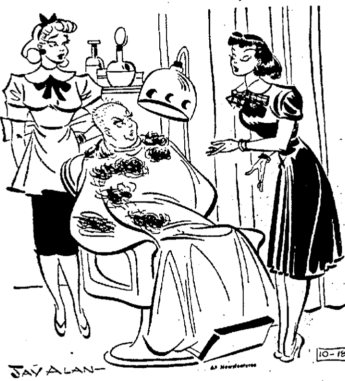
"We decided, Madam, we'd better start from scratch!"