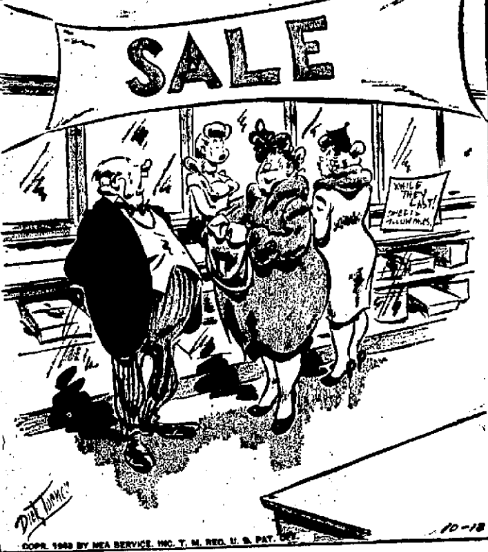
"Of course we aren't cutting prices—this is just a pre-price-raising sale!"

Q. When will the present federal rent control expire? M. M.