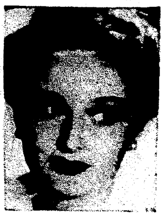
CELESTE HOLM WISC at 8:30