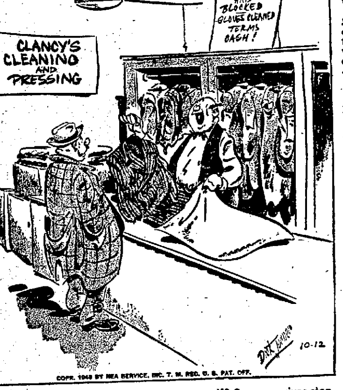
"Why don't you clean out the pockets yourself? So many wives stop looking as soon as they find a wallet or a piece of change!"