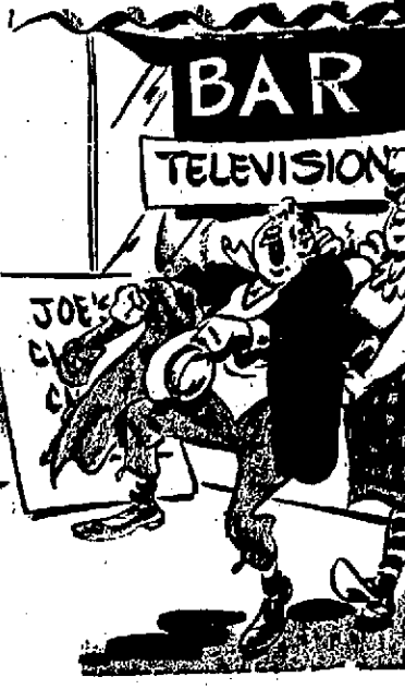
"But, Pat, I gotta be a regular weekday patron or else I won't have no seat to see the big Saturday football games!"