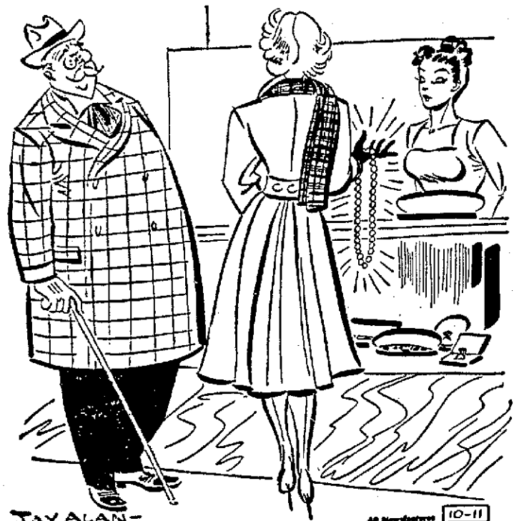
"So I just had a birthday last week? You've had more than one birthday haven't you?"