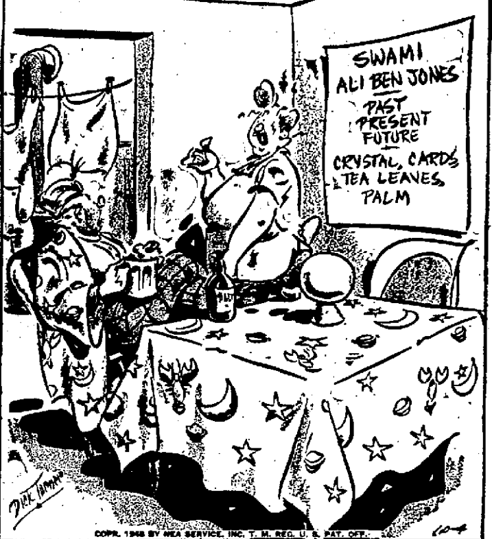
"The Callahans upstairs are fighting again. Take a look in the crystal ball and see what it's all about!"