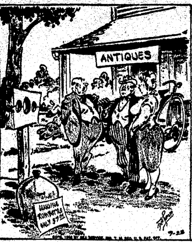
"Not only are these stocks a genuine antique, but they may save you some money on baby-sitters!"