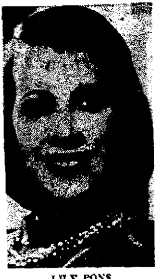
LILY PONS WIBA at 8