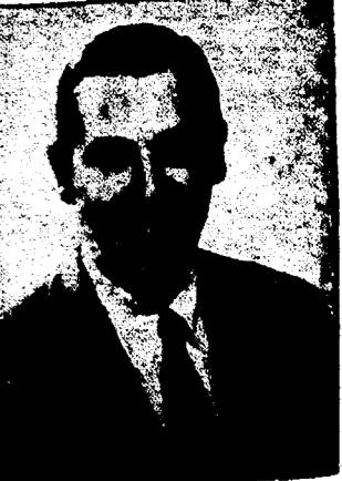
MILTON BERLE WISC at 9:30

4:45 p. m. — Excursions in Science (WHA); "New Uses for Rare Elements."