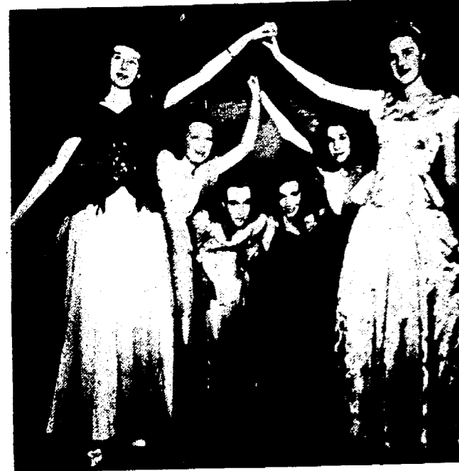
Here are the "Earl Carroll Girls" who will appear in "Fun For You" at 8:15 p. m. Thursday and Friday at Lake Edge park. The revue will be presented by the Frank Allis Parent-Teacher Assn. Proceeds will be used to buy equipment for the new Allis school auditorium.