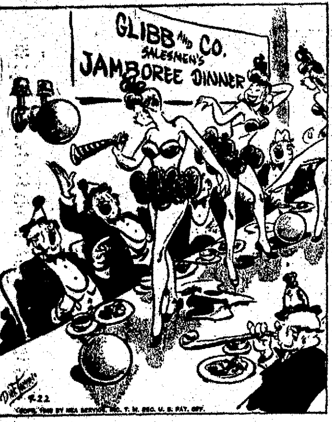
"The next time you're down this way would you please pass the cream?"