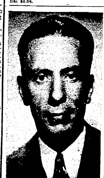
Sen. Fred Risser

Republican Candidate for State Senate will speak on his own behalf.