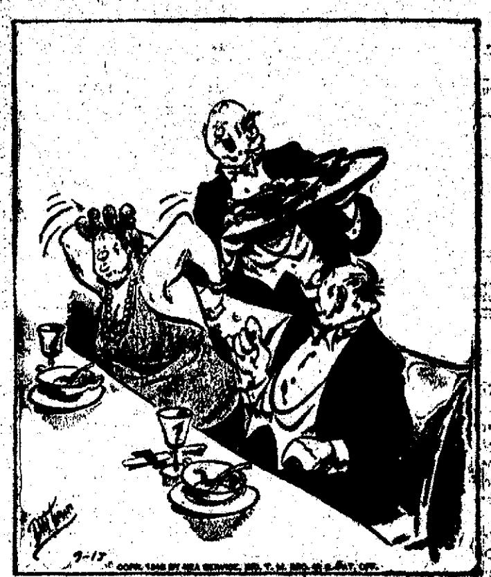
"Don't bother about it—it was only a piece of dark meat!"