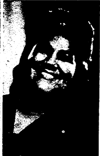
DOROTHY MAYNOR WBBM at 7