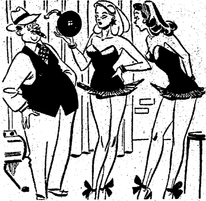
"Then when the bomb goes off it really brings down the house!"

Q. Why was Reading, Pa. named for Reading, England? I. B. O. A. William Penn came from Reading, England. His sons, Thomas and Richard founded Reading, Pa.