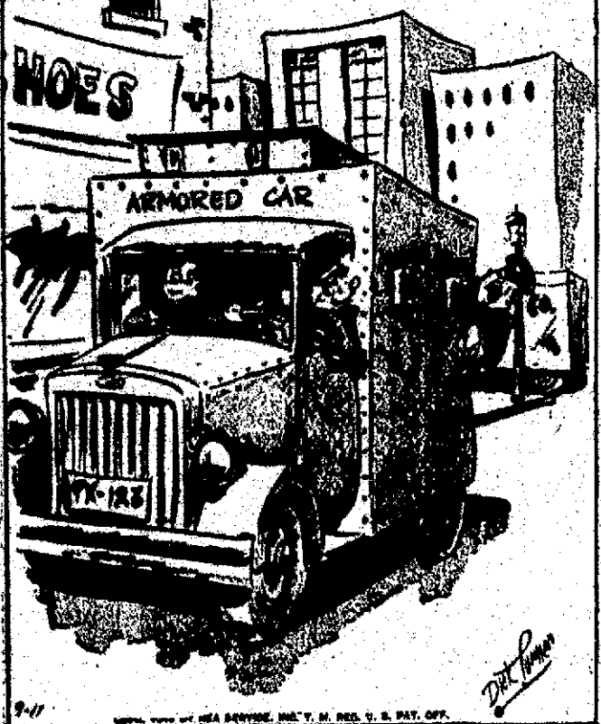
"Why do you keep stopping short like that? I just had it all stacked again!"