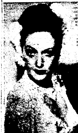
DOROTHY LAMOUR WIBA at 8:30