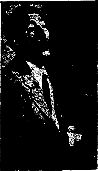
HAL PEARY as "The Great Gildersleeve" WMAQ at 6:30.

8 a. m. - Fred Waring (WMAQ): "My Blue Heaven"; "Cielito Lindo"; "And the Angles Sing" (on WIBA at 9). 9:30 a. m. - Political Forum (WHA): W. O. Hart, Socialist candidate for lieutenant-governor.