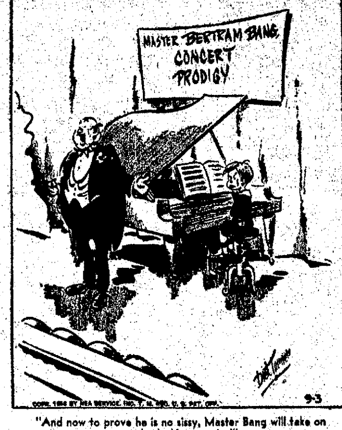
"And now to prove he is no sissy, Master Bang will take on enybody his own size!"

many. H. H. C. A. Each person in the west-ern sectors has been allowed to exchange 60 old marks for 60 of the new Deutsche marks. Half of the rest of his money can be exchanged at the rate of 10 old marks for one new one. The other half of his holdings are blocked pending special action. The new money was introduced by the American, British and French authorities on June 20. to replace the old and badly inflated money and reduce the currency in circulation.