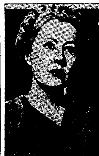
IRENE DUNNE WBBM at 7

Barbara Bel Geddes in "I Remember Mama." 8 p. m. — My Fried Irma (WBBM): returns to the air with Marie Wilson, Cathy Lewis. 8:30 p. m. — Radio City Playhouse (WMAQ): dead-end kid steals watch from soft-hearted policeman (on WIBA at 9:30).