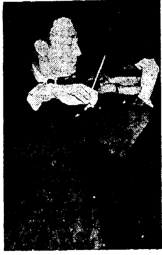
JASCHA HEIFETZ WIBA at 8