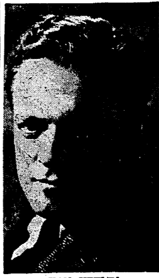
VAN HEFLIN WBBM at 7