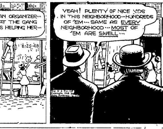
—By HAROLD GRAY