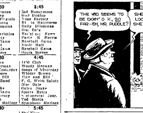
—By CHIC YOUNG