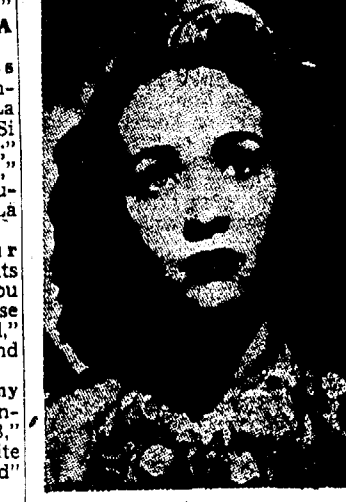
JANE POWELL WIBA at 9