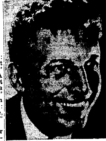
EZIO PINZA WIBA at 8

6 p. m.—Supper Club (WIBA): Woody Woodpecker, "You Can't Be True, Dear," "Rambling Rose," "A Fella With an Umbrella," "A Tree in the Meadow," "First Piano Quartet (WMAQ): "La Comparsa," "Danse Macabre," "Liebestraum," "Braziliera" (on WIBA at 7)... Sound Off (WLS): Margaret Whiting and Red Wing, guests: "Gut Up Off'n the Floor," new Arizona march.