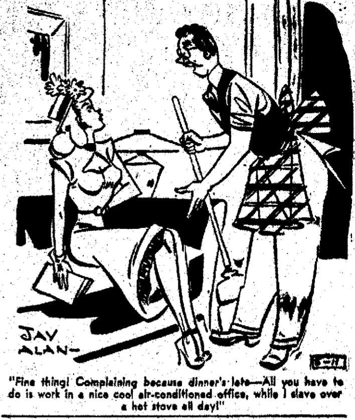
"Fine thing! Complaining because dinner's late—All you have to do is work in a nice cool air-conditioned office, while I slave over a hot stove all day!"