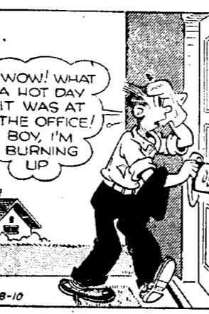
THEY'LL DO IT EVERY TIME