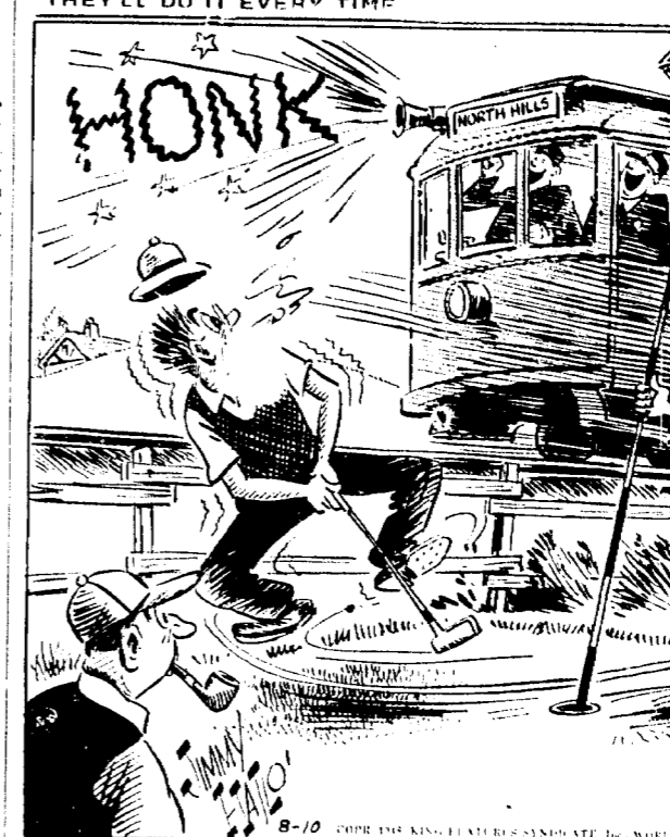
By CHIC YOUNG

they can handle. If they can't make a receiver work with a simple installation, they just won't bother."