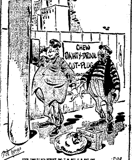
"Could we stop by my place on the way, officer? My wife just gets terrible fussy if I don't come straight home from work!"