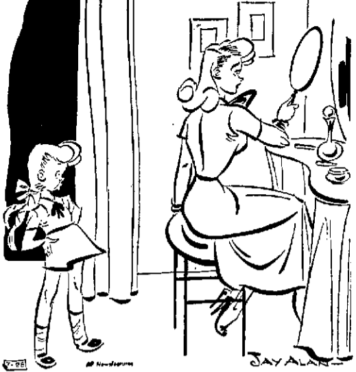
"You know, mother, every year it takes you longer and longer to make yourself look pretty."