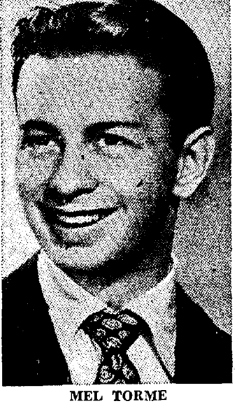
WIBA at 7