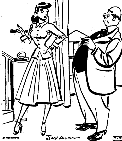
Why, daddy, I did not pravericate. I just told you a simple little lie!