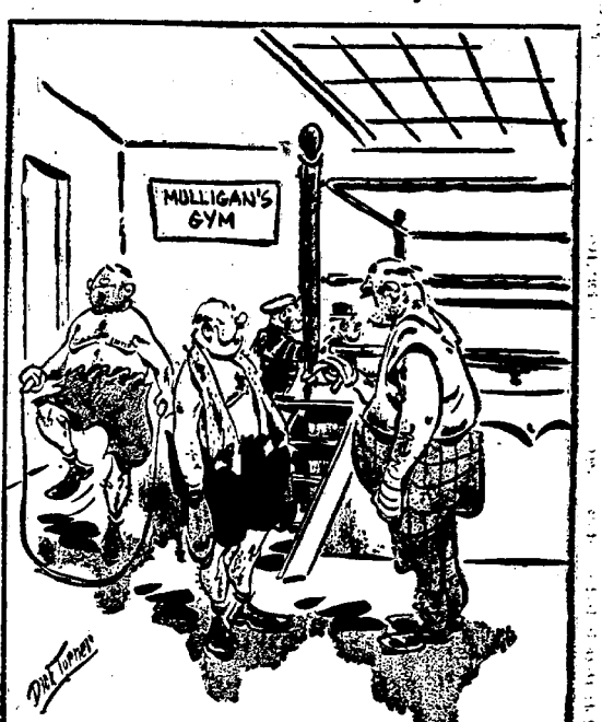
Your right cross is good, an' now you got a nice left hook and fair defense—polish up your infighting an' you can tell your old lady what's what!