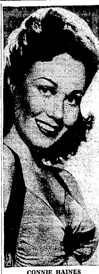
CONNIE HAINES WBBM at 7

6:00 Farm Frolic 6:15 Bulletin 6:30 Jimmy & Ramon 6:45 News: Clock 7:00 Musical Clock 7:15 Musical Clock 7:30 Musical Clock 7:45 Musical Clock